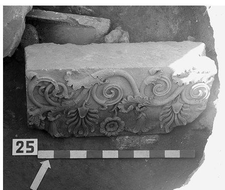
Fig. 6. Nymphaion. Section “M”, pit no. 25, architectural detail. 2007.