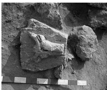
Fig. 7. Nymphaion, necropolis. Keystone with a bull head. 2012.