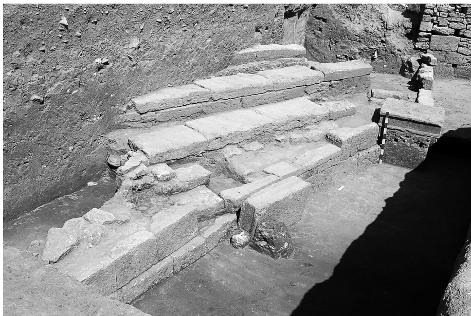
Fig. 4. Nymphaion. Section “M”, amphitheatre benches. 2009.