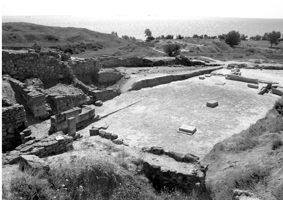
Fig. 3. Nymphaion. Section “M”, western excavation. 2013.