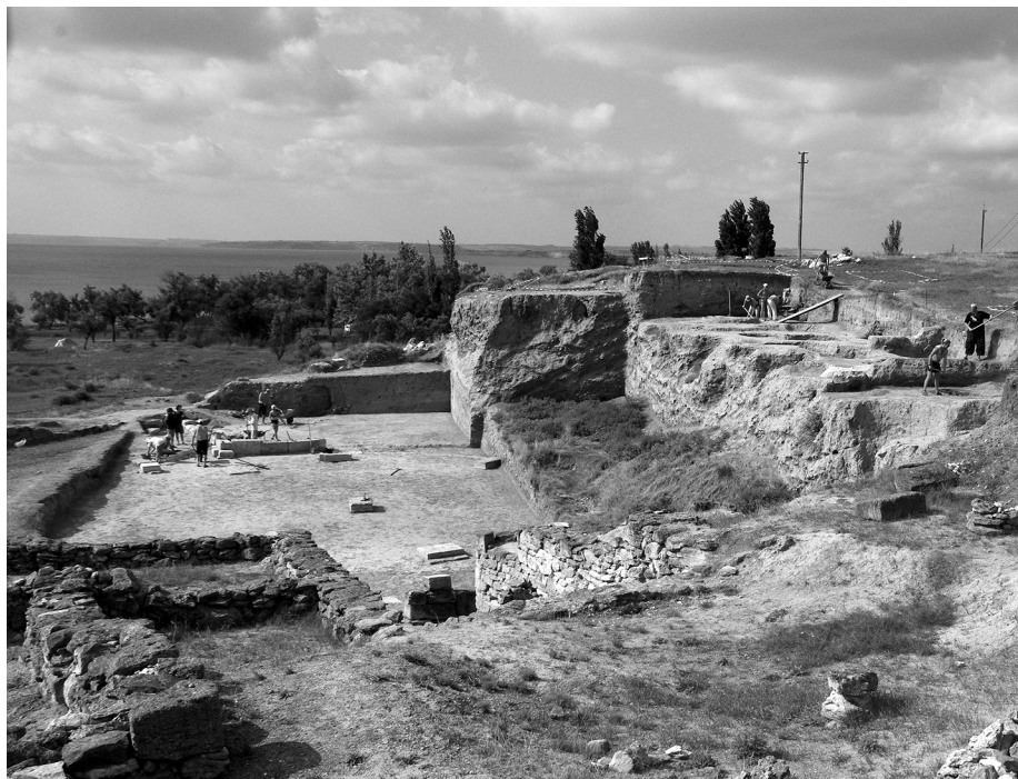
Fig. 1. Nymphaion. Section "M", view from the East. 2012.