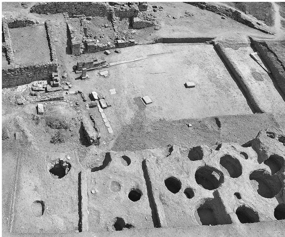
Fig. 5. Nymphaion. Section “M”. 2011.